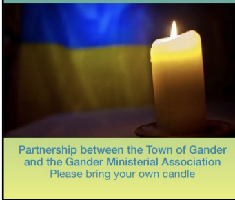
Partnership between the Town of Gander and the Gander Ministerial Association Please bring your own candle

Candlelight Prayer Vigil for Ukraine Wednesday April 27 7:30 pm In front of the Town Hall