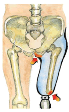
Figure 2. This figure shows the pelvic and transfermoral skeletal system and the pressure areas that can occur if the residual limb shrinks and requires a sock to replace the volume loss.