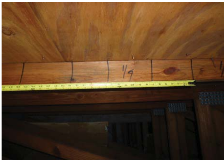
#3 ROOF DECK ATTACHMENT 6" X 6" NAIL SPACING