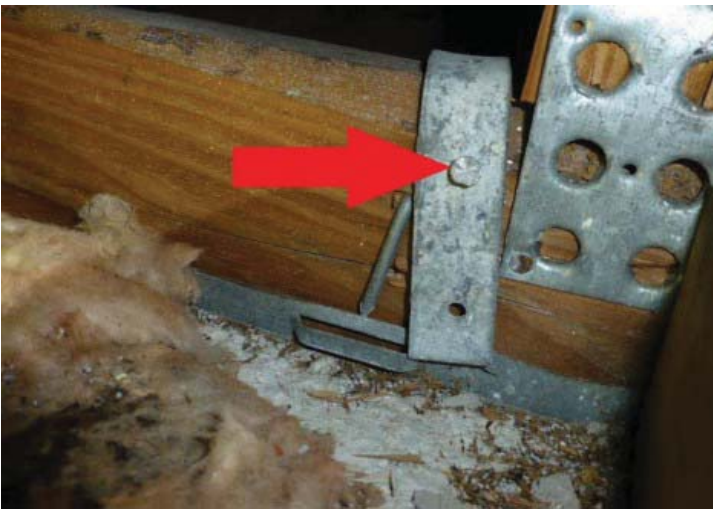
#4 ROOF TO WALL ATTACHMENT OPPOSITE SIDE