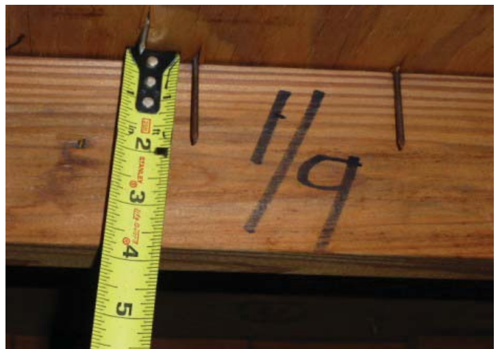
#3 ROOF DECK ATTACHMENT 8d NAILS