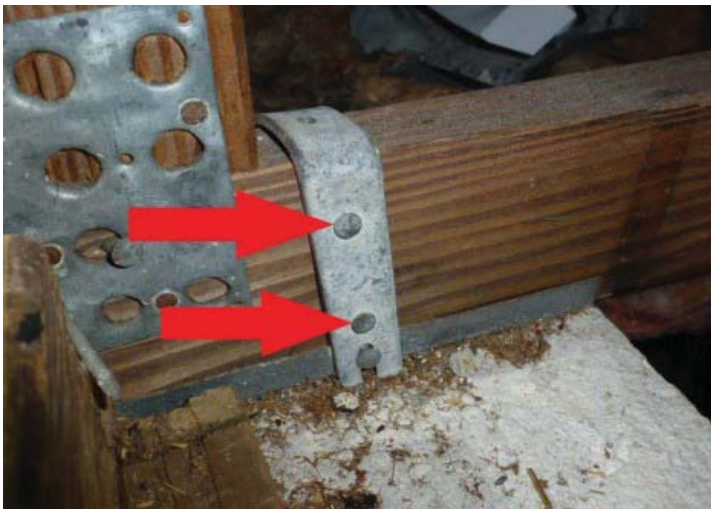
#4 ROOF TO WALL ATTACHMENT FACE SIDE