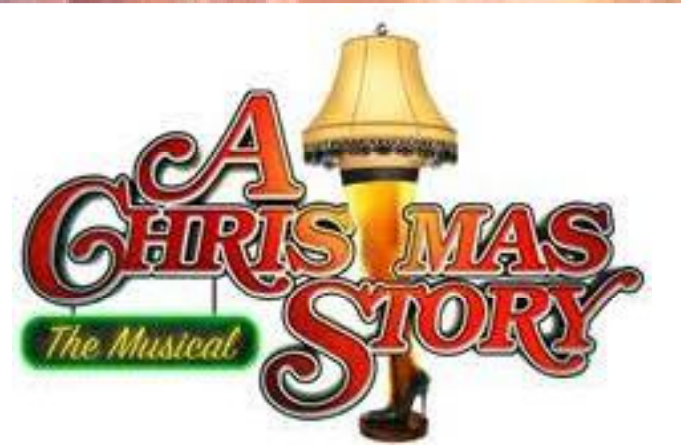
AT BROADWAY PALM FROM NOVEMBER 23 TO DECEMBER 25

Thanks, to the 'snow birds who live here part-time that got us all going again..