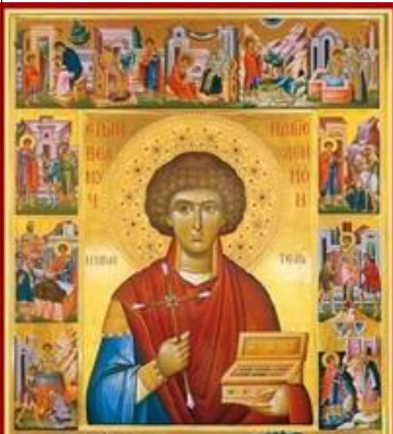
Gr. Martyr and Healer St. Panteleimon