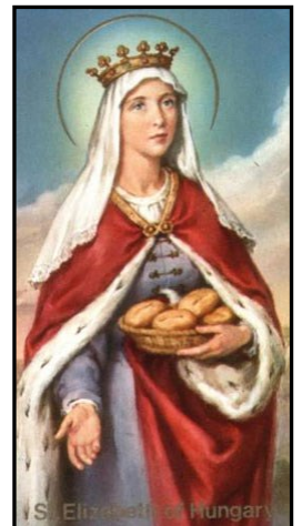
Feast Day: November 17

St. Elizabeth was canonized in 1235. Her feast day is celebrated on November 17 and she is the patron saint of bakers, beggars, brides, charities, homeless people, hospitals, and widows.