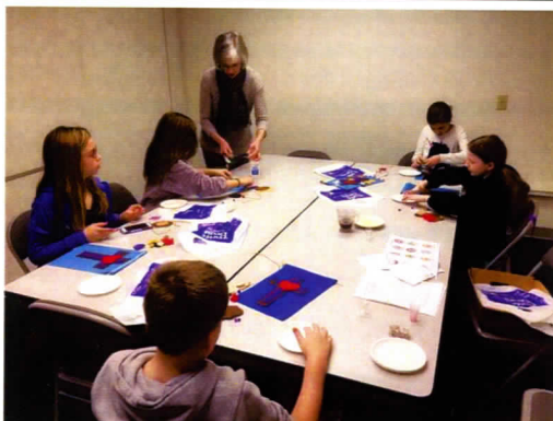
First Communion Class Craft Activity

Come and visit us! We'd love to tell you more about our congregation, and learn more about yours!