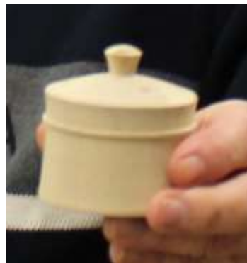
Dusty is holding two lidded boxes turned by Ian