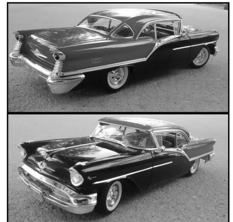
1957 Olds (1/8 scale model from the collection of Gary Swanson)