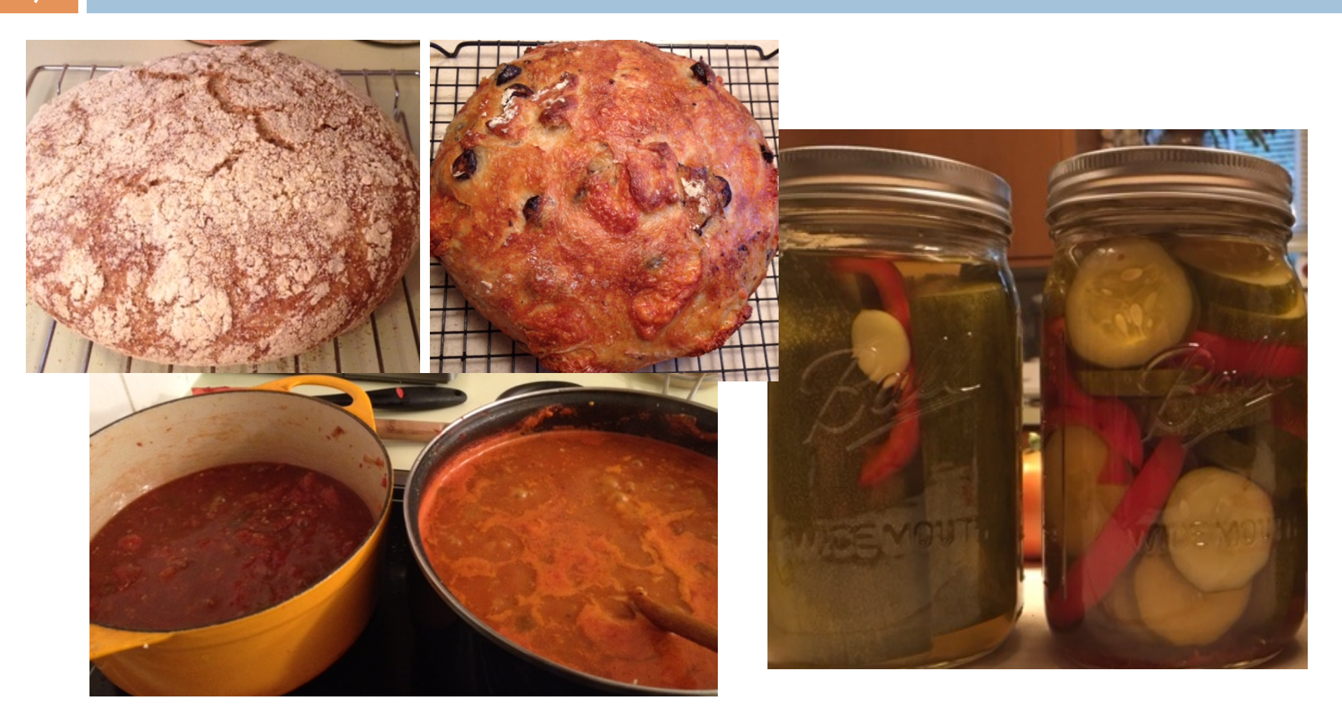
Employment First – April 22, 2016. Kansas AgrAbility, http://www.bae.ksu.edu/extension/agrability/