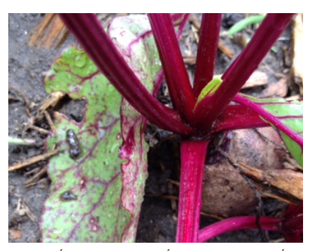
Employment First – April 22, 2016. Kansas AgrAbility, http://www.bae.ksu.edu/extension/agrability/