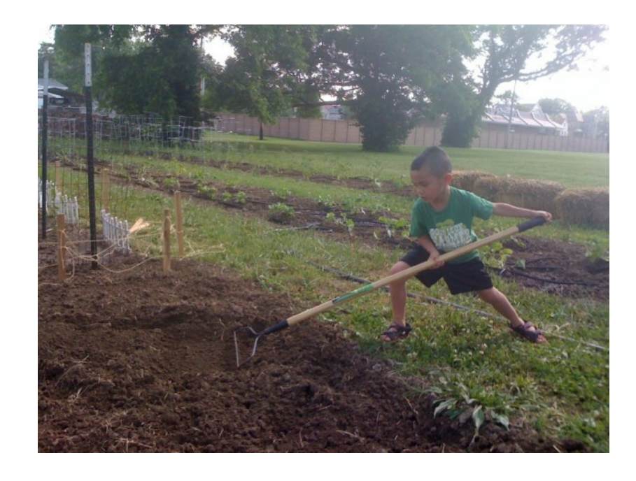
Employment First – April 22, 2016. Kansas AgrAbility, http://www.bae.ksu.edu/extension/agrability/