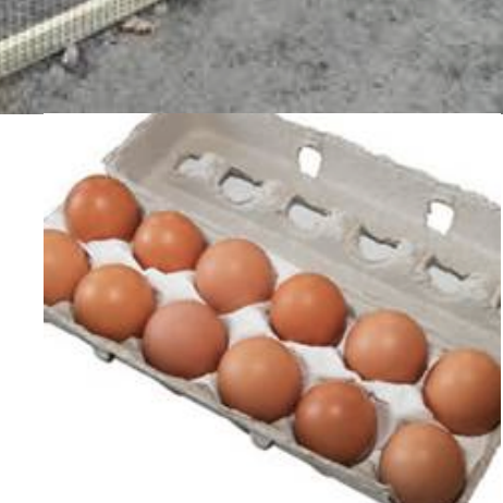
Employment First – April 22, 2016. Kansas AgrAbility, http://www.bae.ksu.edu/extension/agrability/