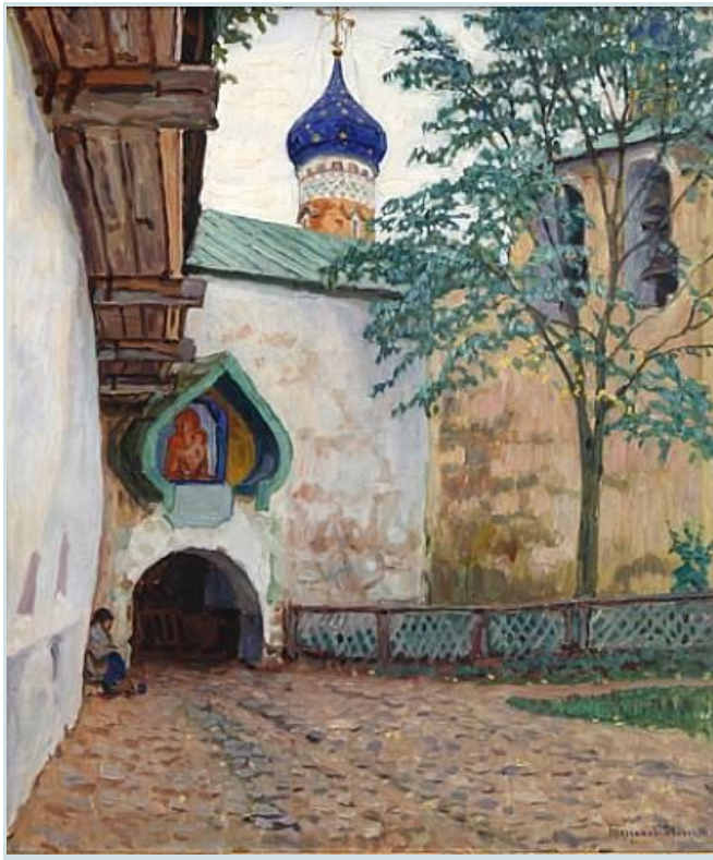
Pechersky Monastery - Nikolay Bogdanov-Belsky