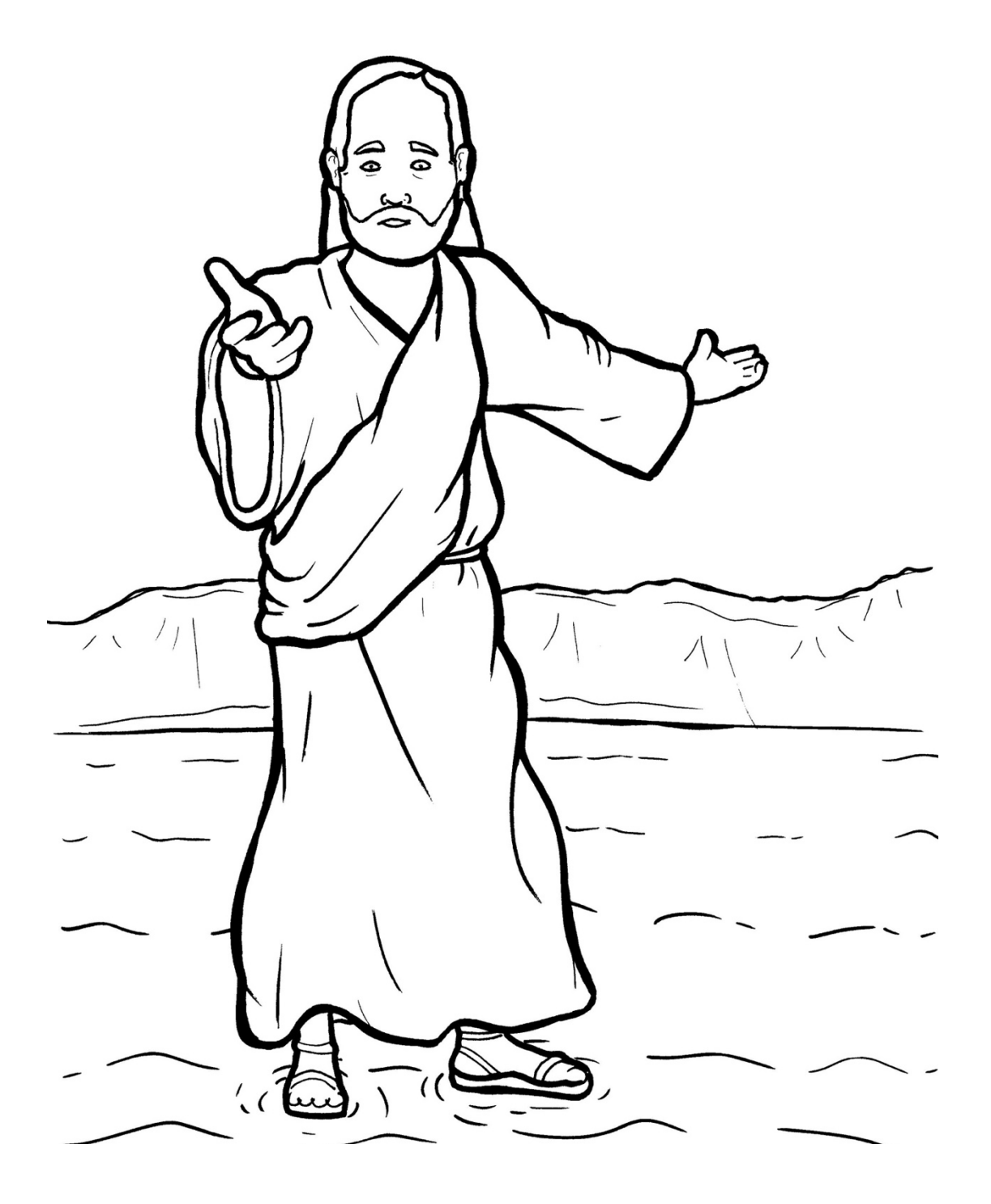
Jesus said, "Be brave. It is me! Don't be afraid." Matthew 14:27