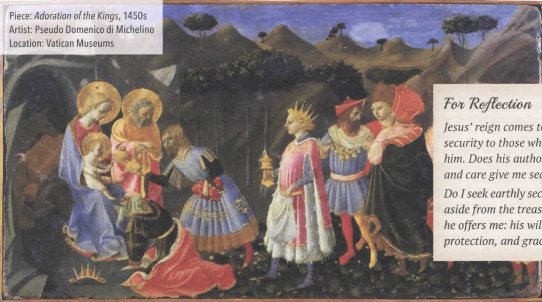
Piece: Adoration of the Kings, 1450s Artist: Pseudo Domenico di Michelino Location: Vatican Museums