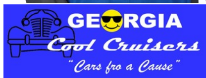
< Jacket Back Design