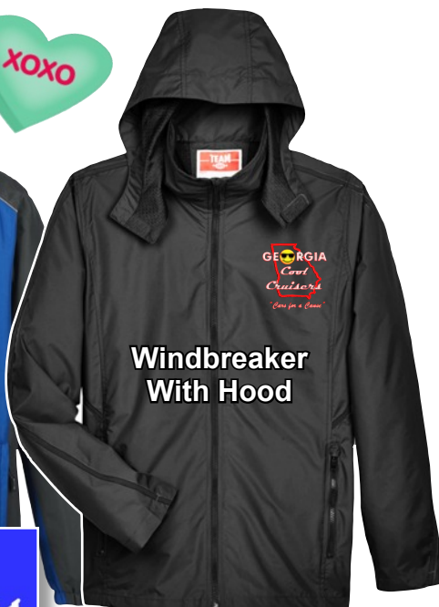
Windbreaker With Hood