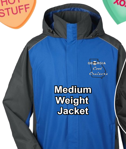
Medium Weight Jacket