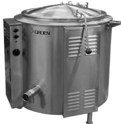
Model EE-60 shown

Kettle shall have an electric, self-contained steam source to provide kettle temperatures from 150 to approximately 270°F. Unit shall be factory charged with chemically-pure water and rust inhibitors to ensure long life and minimum maintenance.