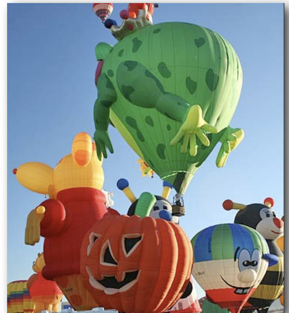
Albuquerque is known for its annual Balloon Festival