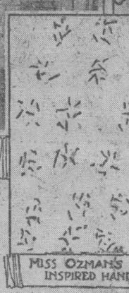
MISS OZMAN'S INSPIRED HAND