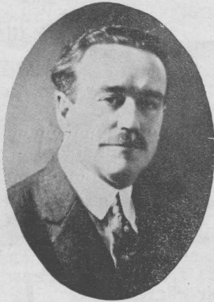
Rev. Charles Fox Parham

In October, 1900, Rev Charles F. Parham opened Bethel Bible College in Topeka, Kansas. Forty students entered realizing their need of more power from God with which to