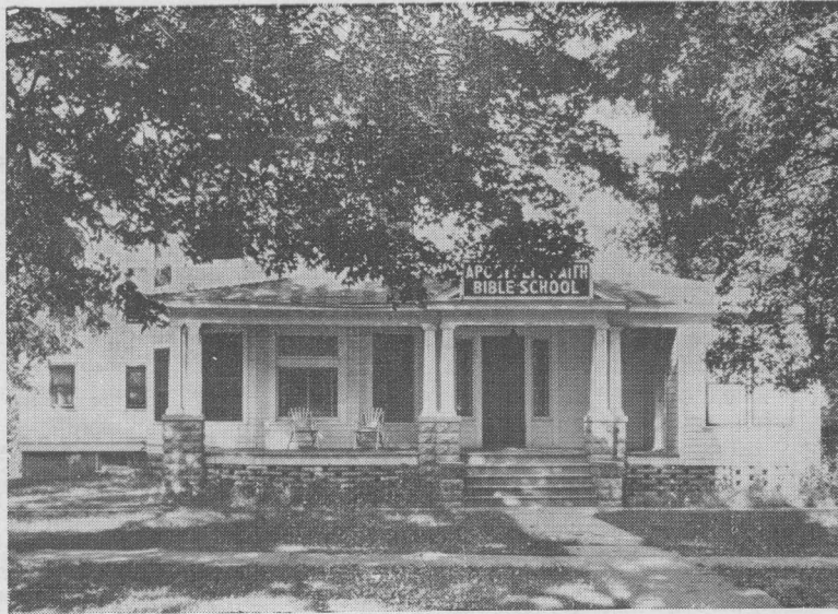
BIBLE SCHOOL HOME

The Apostolic Faith Movement was born in a Bible School in 1900, and we praise God that the Bible School vision is still with us today. In another place in this paper a complete account is given of the Bible School in 1900.