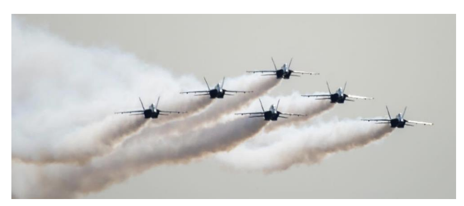
Jets flying in formation.