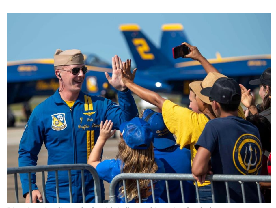
Blue Angels pilot enjoying high-fives with enthusiastic fans.