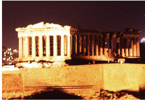
Parthenon, Athens

Platonic and Aristotelian ideas and world views dominate in the coming Christian era and give a foundation for Christians to communicate their worldview with their society. Plato with his dualistic opposition between good and evil. And Aristotle with his emphasis on education and the wholeness of the human psyche. The ideas of soul and body.