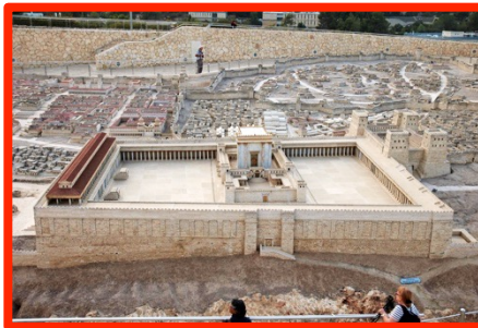
Temple “powers” Saducees