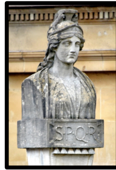
Roma goddess of Rome (JRT)