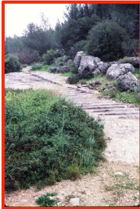
B. Roads (JRT)