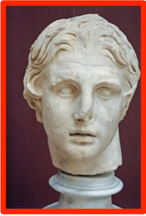
Alexander the Great bust, Archeological Museum, Istanbul (JRT)