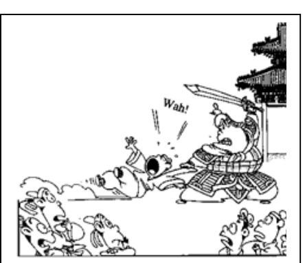
Whenever we begin new classes, We have found it to be a good policy