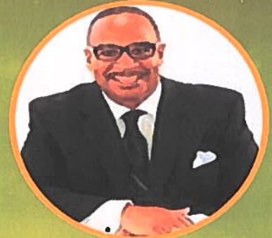
Bishop Sir Walter