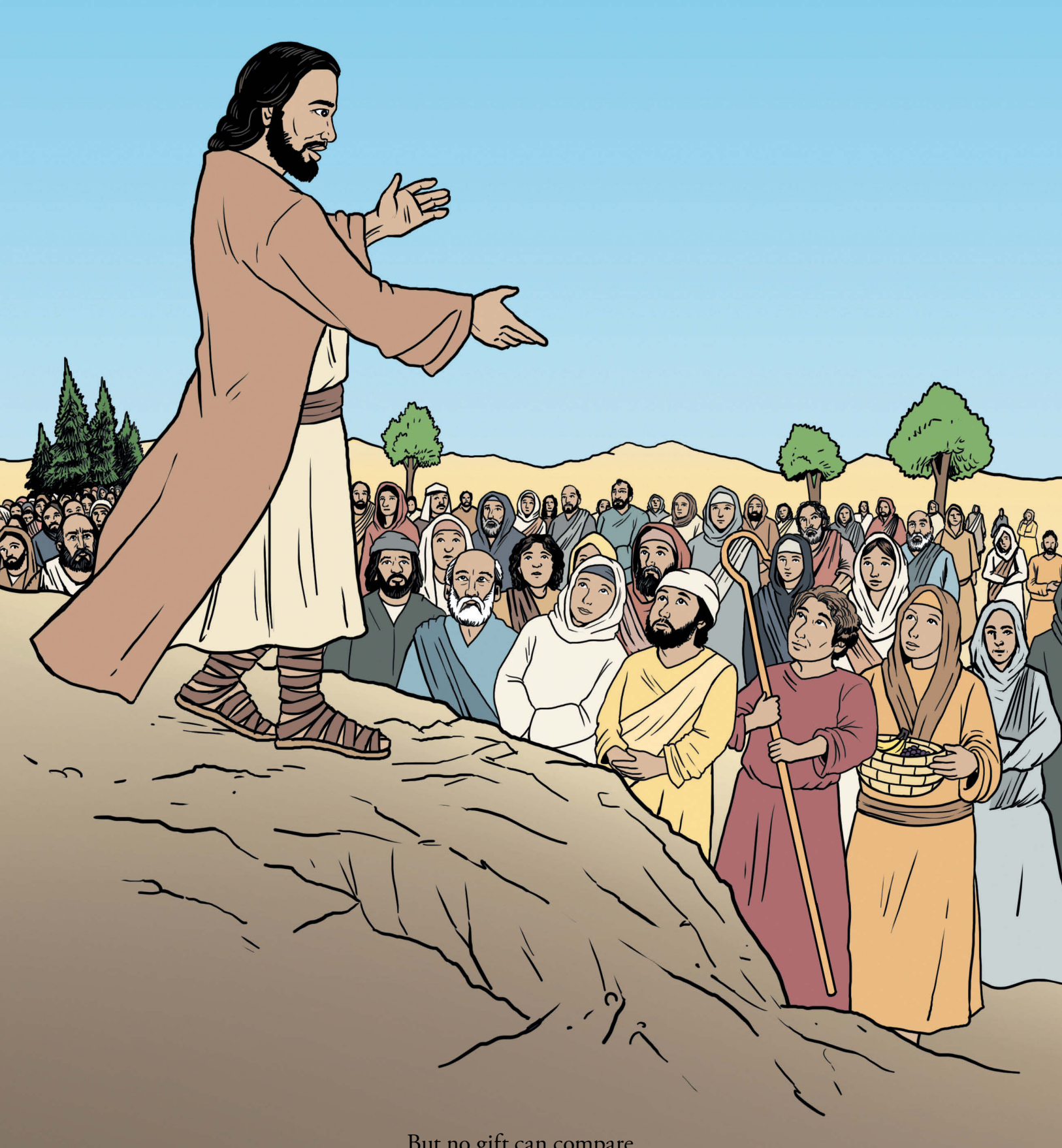
But no gift can compare. To the blood of Jesus Christ.