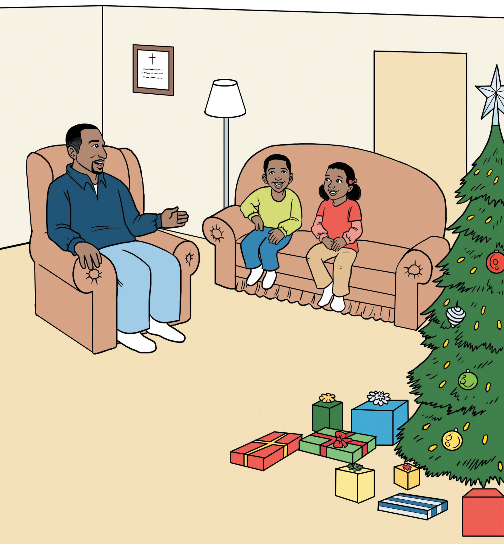
Uh yeah, yeah sure; yeah I guess you're right. Yeah Christmas is all about gifts; Sit down, let me explain.