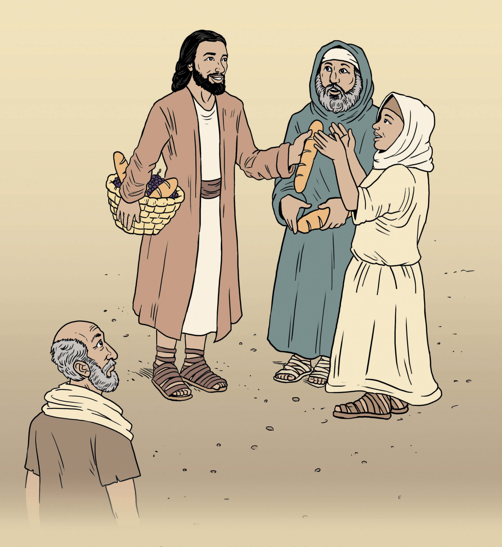
He fed the poor and healed the sick, but died at 33. But this just wasn't any death, He did it for you and me.