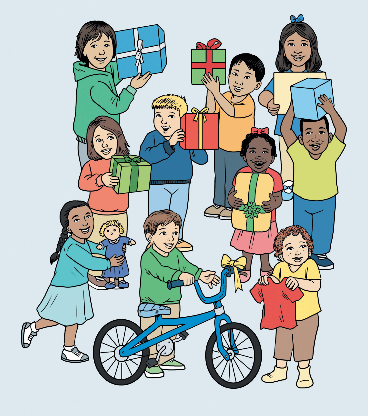
Some will get clothes, some will get bikes. Some will get whatever they like.