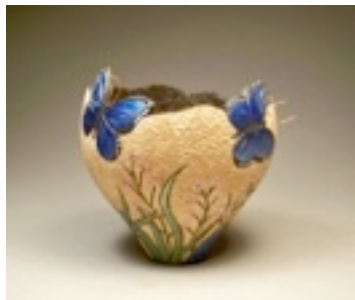
Rain Forest Treasures Series