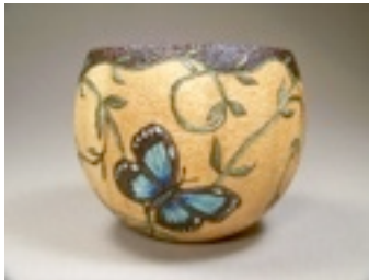
Rain Forest Treasures Series