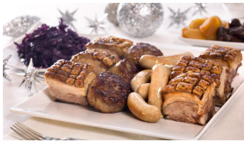
Jule-ribbe, medisterkaker, medisterpølse

Christmas Food - Christmas foods are something very special. When someone says Christmas, food is almost immediately the next thought. For many of us the feeling of Christmas is tied directly to eating plenty of good holiday foods.