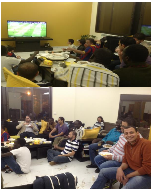
An Evening with Students at our Place