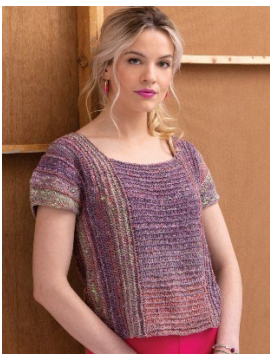
More Than One Direction

https://www.ravelry.com/patterns/library/riven-5