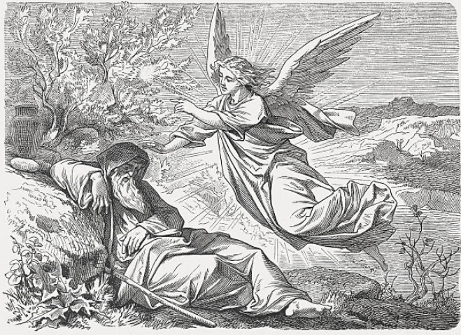
By: The Word Among Us