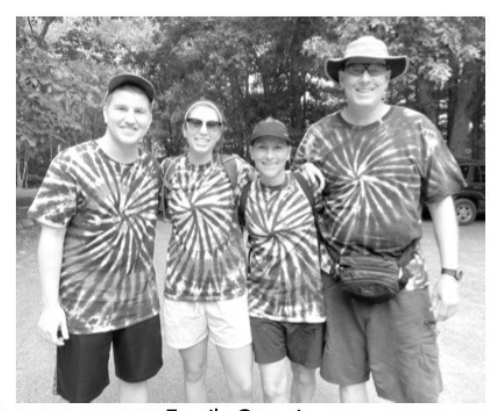
The BCCCC was a select group of

As Bear Creek Camp moves towards the Fall and beyond, your prayerful financial support will be more important than ever before. To learn more about programs at BCC throughout the year, visit <a href="https://www.bearcreekcamp.org">www.bearcreekcamp.org</a>.