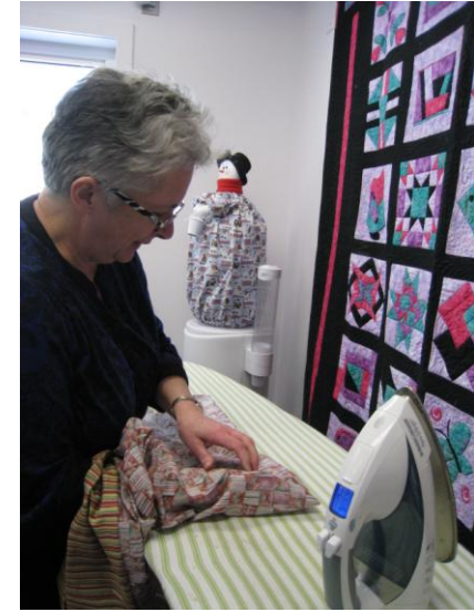
Pillowcases for Kids, 2014

The Guild holds an annual retreat, which offers members a fun weekend of fellowship and project advancement. A quilter can get an amazing amount done in a few days of uninterrupted sewing!