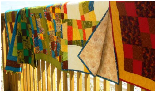
A railing full of donated quilts.