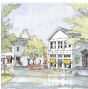
Village of Interlochen, Michigan