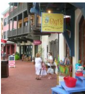
Rosemary Beach, Florida