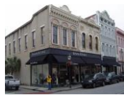
Charleston, South Carolina