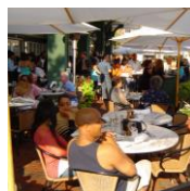
Easton Center, Columbus, Ohio