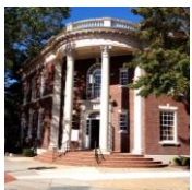
Southampton, New York