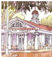
Howell Town Center, Michigan