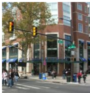
University of Pennsylvania

Coconut Point Town Center/ The Simon Company, Bonita Springs, Florida: 2000 Glenview Town Center, Glenview, Illinois: 2000 Eton Street Station Master Plan, Birmingham, Michigan: 2000 Shelby Town Center, Shelby Township, Michigan: 2000 Analysis and Zoning Review, Bay City, Michigan: 1999 Master Landscape Plan, Cherry Hill Village, Michigan: 1999 San Elijo Village Center Master Plan, San Diego, California: 1999 Mt. Laurel Village Center Master Plan (DPZ lead), Birmingham, Alabama: 1998 Northwest Landing Town Center (Calthorpe Associates lead) Dupont, Washington: 1998 Town Commons 60 acre TND, Howell, Michigan: 1998 Washington Village Master Plan, Washington Township, Michigan: 1998 Heritage Village Master Plan & Landscape Plan, Waterford Township, Michigan: 1997 Westwood Village Master Plan & Landscape Plan, Beverly Hills, Michigan: 1996-1997 Kentland's Town Center expansion Master Plan (DPZ lead), Gaithersburg, Maryland: 1996 Aberdeen Town Center, Valparaiso, Indiana: 1995 Mayfield Park Village Master Plan, Mayfield Township, Michigan: 1995 The Vistas Master Plan & PUD approval, Novi, Michigan: 1993 Woodside Village 800-acre Master Plan, Grand Blanc, Michigan: 1991