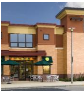
Middleton Hills, Wisconsin