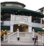
Coconut Grove, Florida