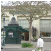
Santa Cruz, California