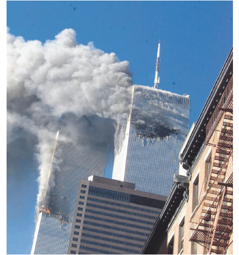
Smoke rises from the World Trade Center after hijacked planes crashed into the towers in New York City on Sept. 11, 2001.