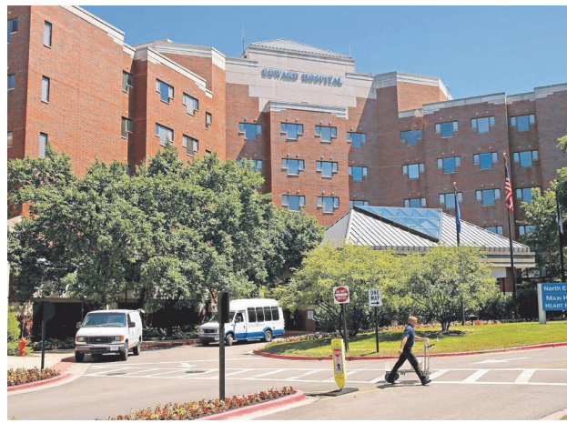
NorthShore University HealthSystem and Edward-Elmhurst Health announced plans Wednesday to merge — a union that would create a nine-hospital system across Chicago's northern and western suburbs that includes Edward Hospital in Naperville, above.