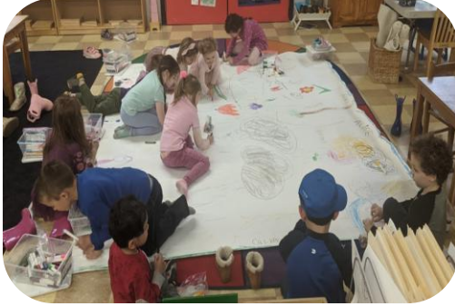
Group Mural Drawing

This past month brought a bit of crazy weather, so our classroom just went with it!