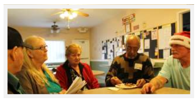
Last Board meeting of 2016

Now to the part you are all waiting for THE PICTURES Thank you Wing for being out cameraman.