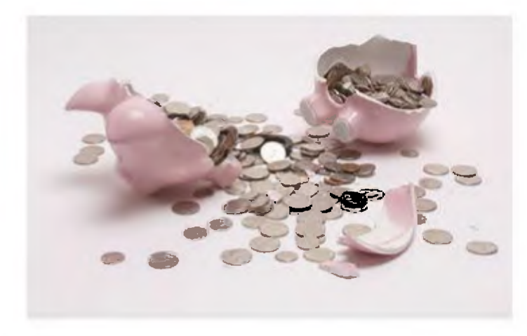
Security and Rural Investment Act Programs at USDA missed their target improper payment amount by 12.14 percent. 536

While the IG noted that USDA has made progress over the five years of non-compliance, some of the 18 programs still lag behind. For instance, the School Breakfast Program within USDA's Food and Nutrition Service had an improper payment rate of 22.95 percent, and the Farm