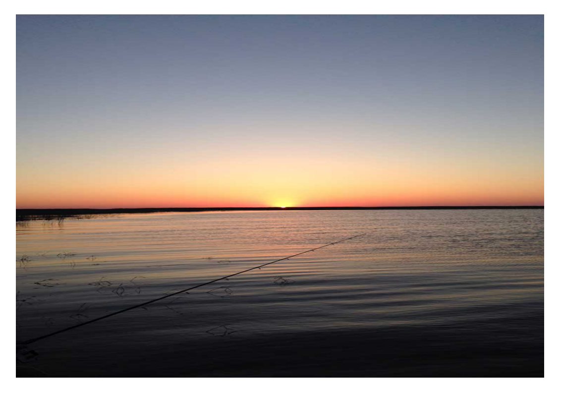
With summer coming, dawn, sunset and night are prime times for fishing. The beauty of sunrise over Lake Okeechobee is hard to beat.

The Stuart Rod and Reel Club is dedicated to improving local fishing through by increasing angler knowledge, encouraging conservation and maximizing the fun involved in light tackle fishing in the Stuart Florida area. We hold monthly meetings on the <u>second Thursday of each month</u>, year round. Please join us or contact any board member for more information on how you can become a member of the Stuart Rod and Reel Club.