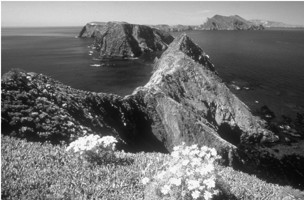
Inspiration Point