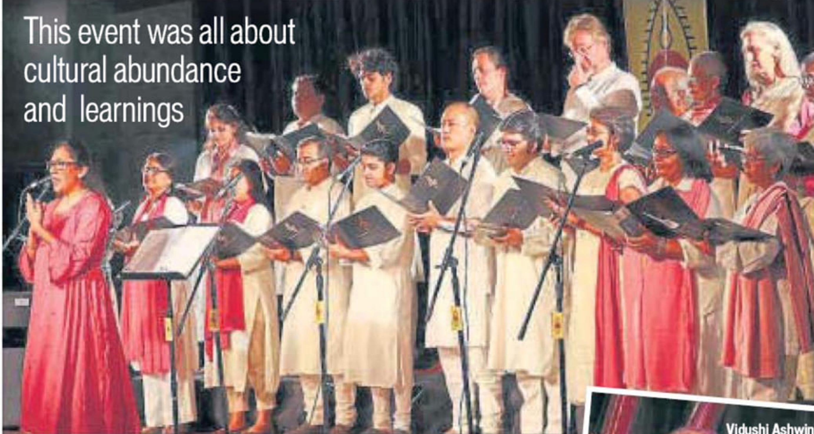
The students concluded the event with a final performance with their gurus

This event was all about cultural abundance and learnings