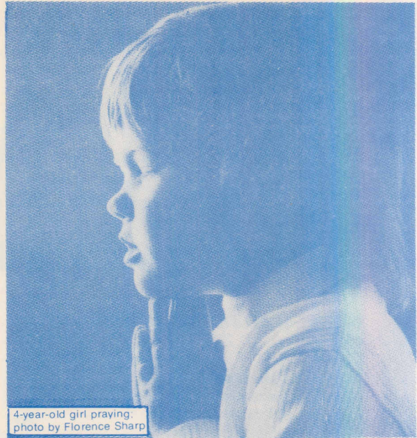
4-year-old girl praying.

Do you suppose that all who use their children as an excuse for not being able to come to church would want God to remove what hinders them from coming?