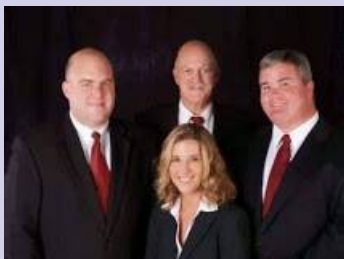
Jendron's: get to know them now

5. Be practical: you can usually put three bodies per grave if you get cremated. Come on, no one REALLY needs to have your family spend as much to bury you as your wedding cost. Hold LIVING MEMORIALS rather than the big tear- and flower-fest that costs so much. Show your people that you love them NOW, not after they're gone. Seriously.