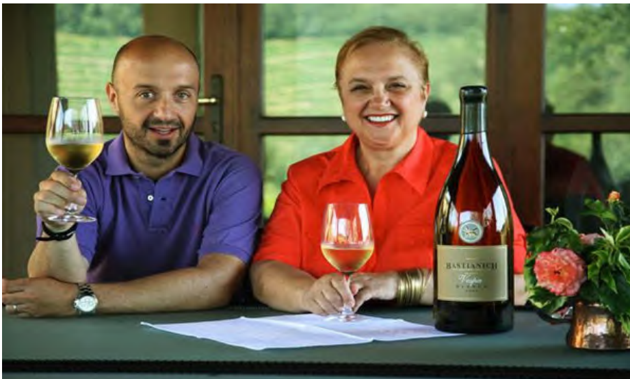
Joe & Lidia Bastianich At the Bastianich Winery in Friuli, Italy