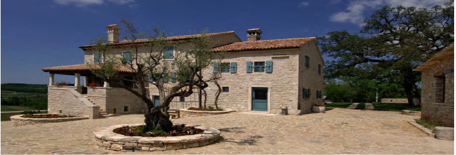
Kozlovic Wine Estate: wine tasting

Istrian winemaker famous for various styles of malvasia and a special type of moscato, especially their recent innovation, application of ancient winemaking technique devised in Caucasian Georgia. Grapes; after being picked are put immediately into terracotta amphorae, sealed and put to ferment in the soil.