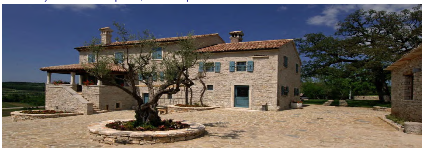
Kozlovic Wine Estate: wine tasting

Istrian winemaker famous for various styles of malvasia and a special type of moscato, especially their recent innovation, application of ancient winemaking technique devised in Caucasian Georgia. Grapes; after being picked are put immediately into terracotta amphorae, sealed and put to ferment in the soil.