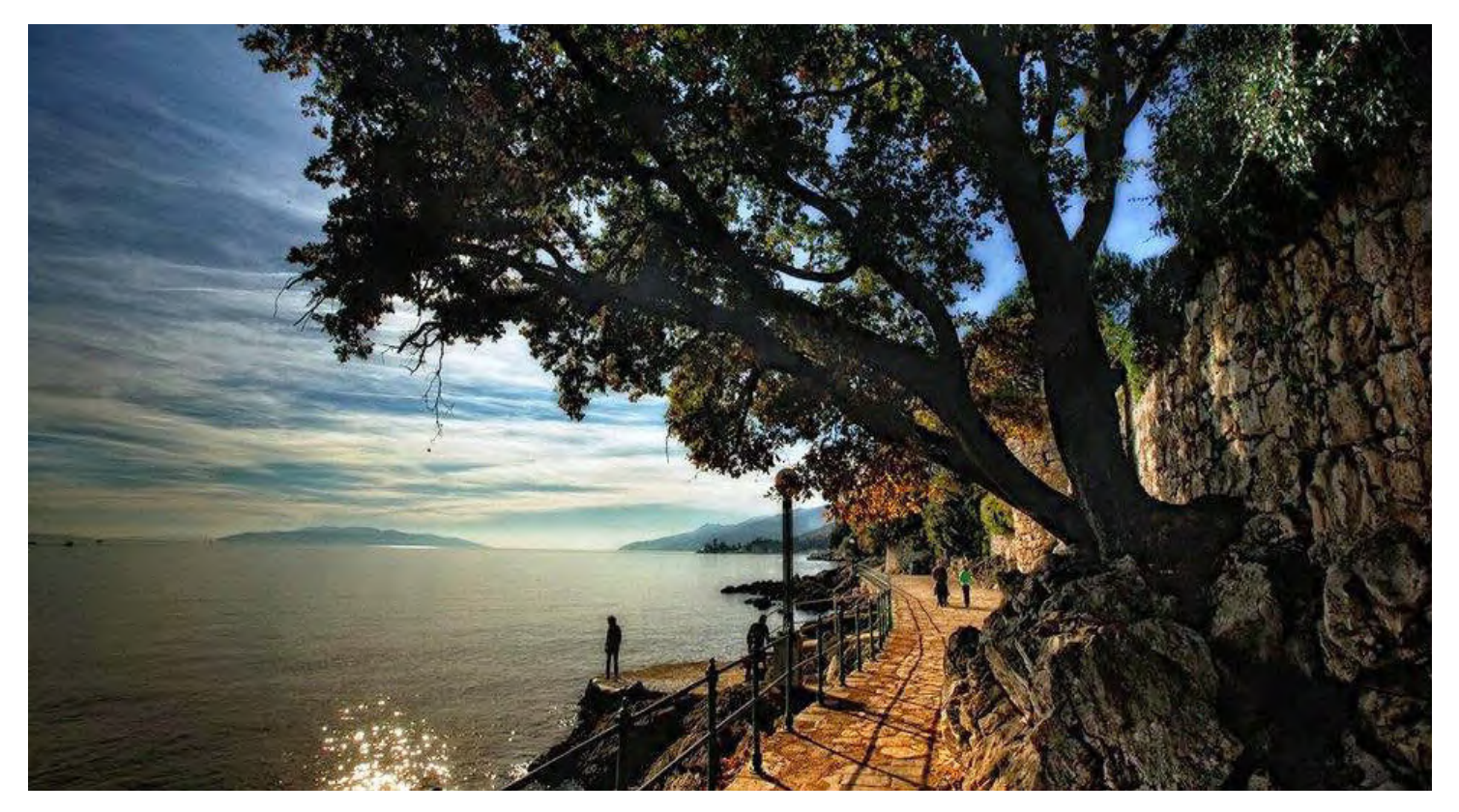
Day 7 -Novigrad - Rovinj - Novigrad

We will visit Matosevic Wine Estate , wine tasting - Ivica Matosevic is one of the most prominent Istrian wine makers and head of Istria Vintners Association. Enjoy the excellent Chardonnay and Acacia barrel aged Malvazija Robinia. We continue on to Rovinj , for the city tour. You will feel the enchantment of this town in its narrow medieval streets and warm Mediterranean setting. From the plateau of St. Euphemia Cathedral there is a wonderful view of the open sea and numerous islets in the distance. Some free time to explore Rovinj. (suggestion: wine bar "Piazza Granda", wine and cocktail bar "Puntulina") This evening a Farewell dinner will be at Restaurant Blu , a creative Mediterranean seafood cuisine. "Blue" is a chic restaurant at a hideout directly at the sea level overlooking the panorama of Rovinj. You will enjoy high end food listening to the waves and enjoying sweet smell that gentle Maestral wind brings from the pine wood that surrounds the restaurant. Overnight in Istria ( B/D )