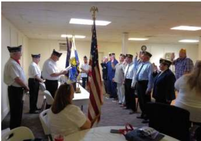
New 18 th District Legion and SAL Officers being installed by the 40&8 Ritual Team.