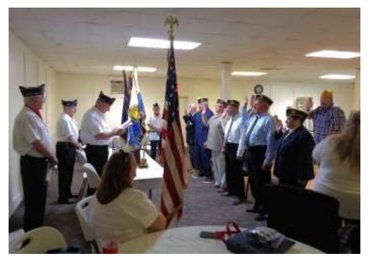
New 18th District Legion and SAL Officers being installed by the 40&8 Ritual Team.