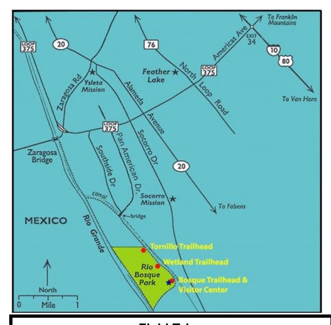
Field Trips Current list of upcoming field trips at http://www.trans-pecos-audubon.com/

The meeting place is a bridge crossing the Riverside Canal. To get there from I-10, take Americas Ave. (Loop 375) to Pan American Drive, turn left onto Pan American and travel 1.5 miles. Information: 747-8663.