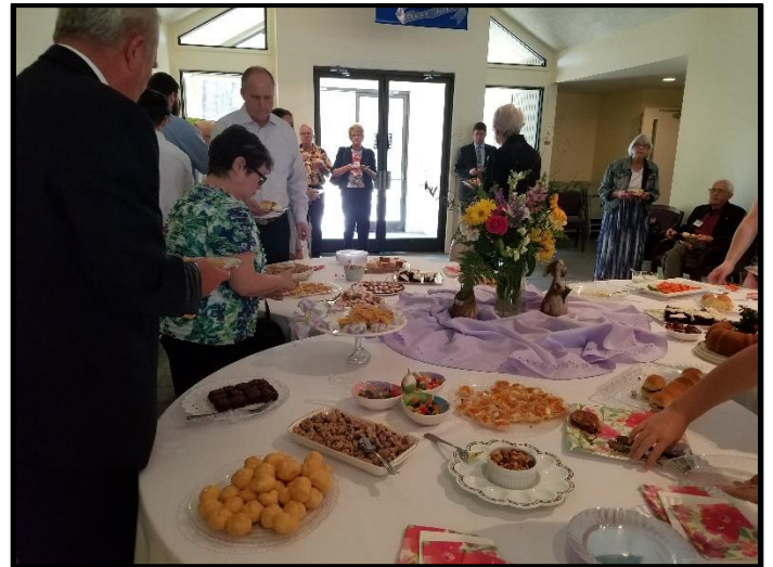
Once again, the ladies outdid themselves with delicious finger foods to enjoy after the service. Thanks to all who contributed!