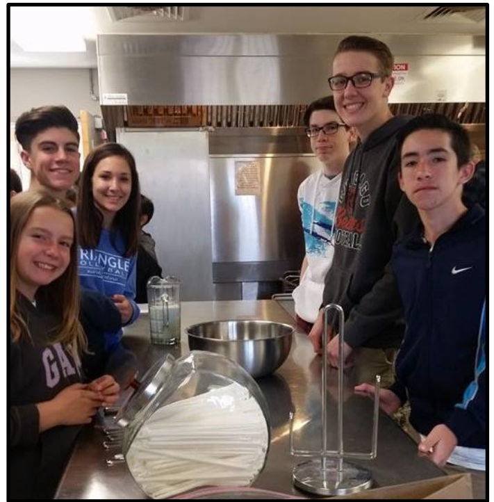
Baking Communion Bread...move over, Ellen!!