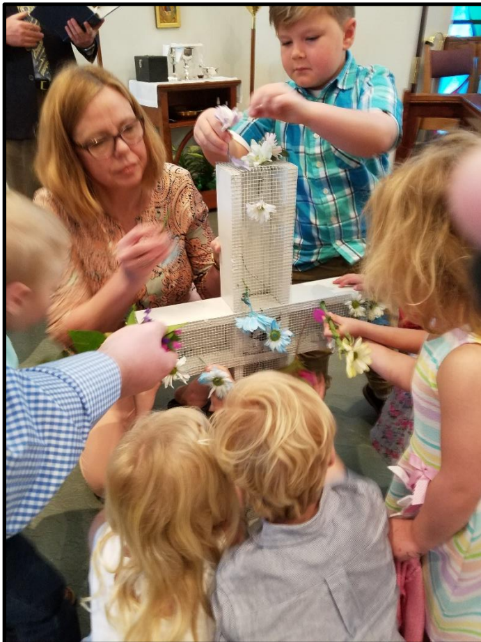
The traditional "Flowering of the Cross" by the youngsters (with a little adult supervision).