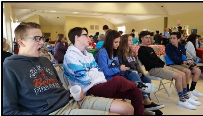
Waiting for things to get started is HARD!