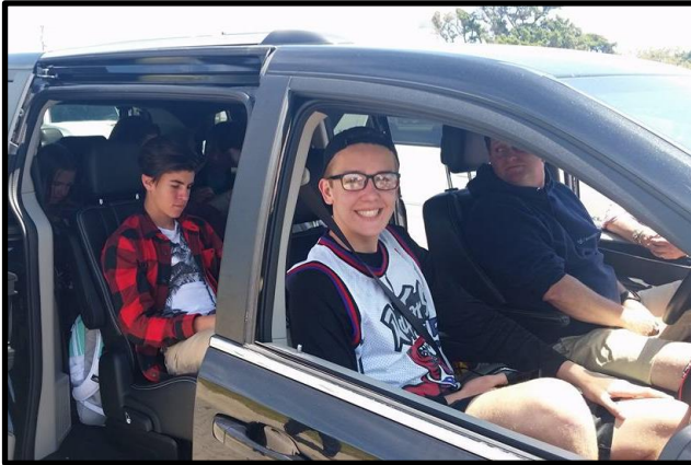
On the road again, headed to Nags Head!