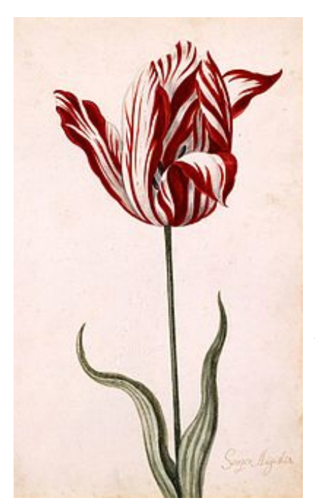
Rule 2: When you invest your savings, don't confuse price for value.

Thus, anyone who wishes to attain some level of financial independence and security in our world of languishing wages would be well advised to complement their earnings from labor with earnings from capital. To have the required capital requires most of us make frugality a personal virtue. This sounds hard. There are many temptations. But remember: the level of material abundance – and at relatively low cost – around us today would be unimaginable to earlier generations of Dutch and non-Dutch alike. So, embrace frugality. It is a source of secondary income that can be invested for future gain and security.