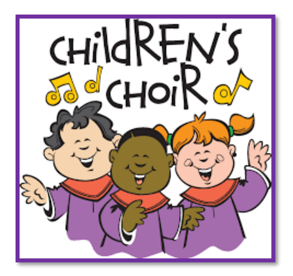
Sunday, May 1<sup>st</sup>. Last day of children's church!