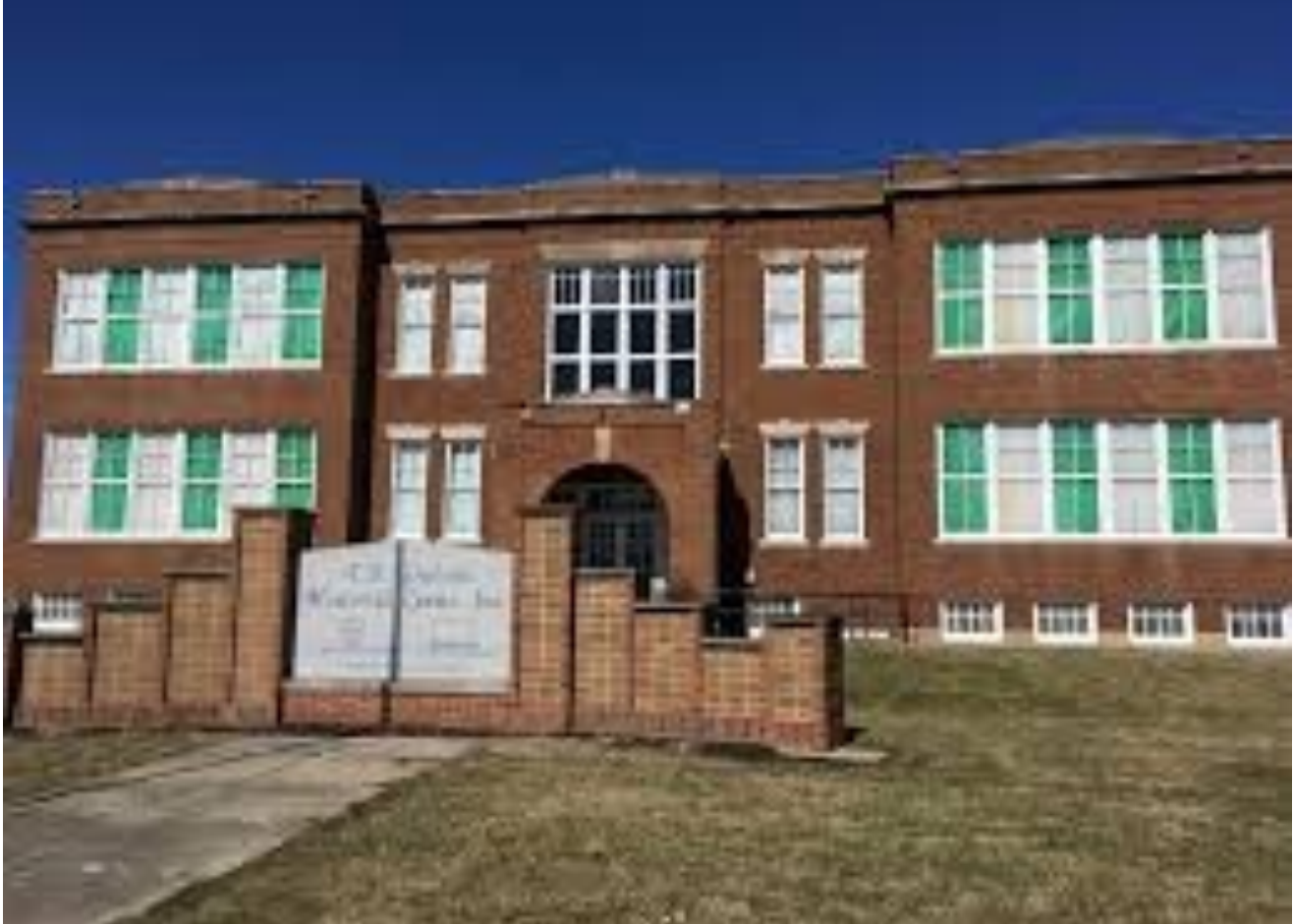
A.B. Graham Center view from U.S. Rte. 36