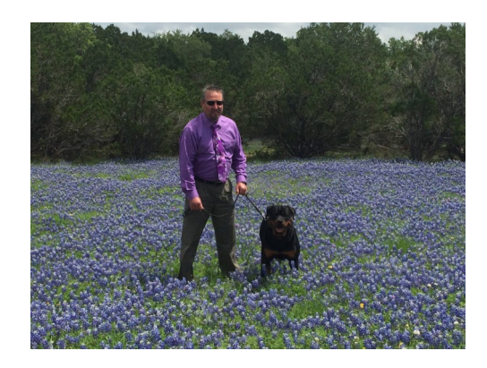
Too Busy? Pick-up & Delivery Is Available