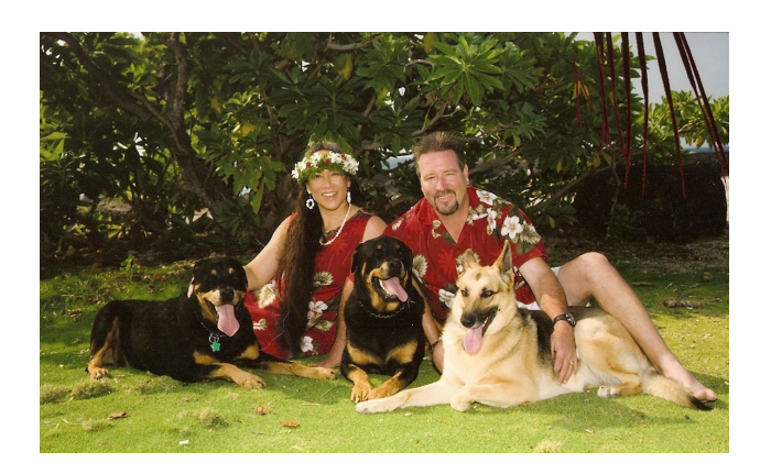
As They Are Trained, So Shall They Perform