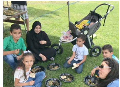
Below: Syrian cooking project on the first day.