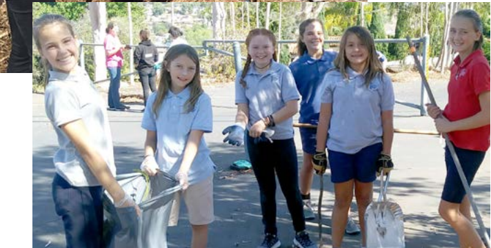
The middle schoolers clean up brush, leaves, and overgrowth around the church and school grounds as a service project on October 19th.